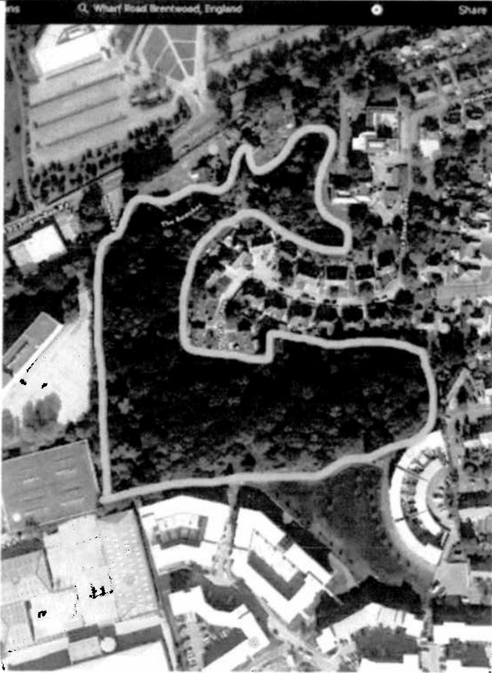
La Plata Wood (a rough indication is above).